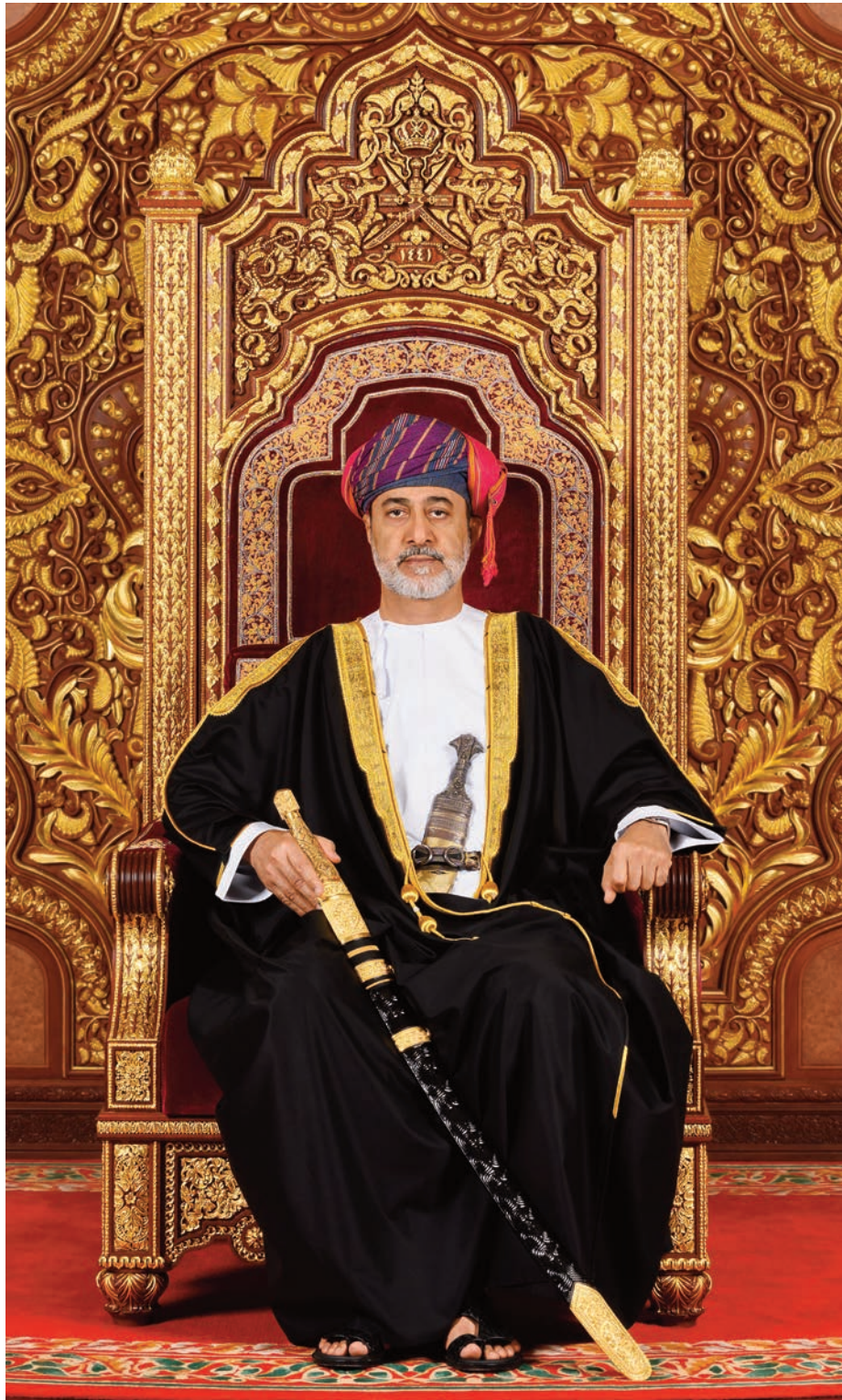
His Majesty Sultan Haitham bin Tarik Al Said